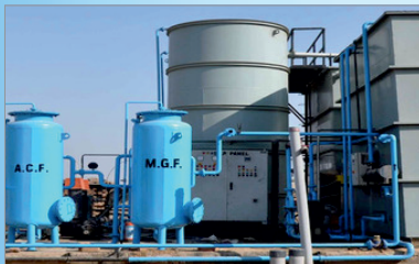
SEWAGE TREATMENT PLANTS

XENTURA ® aims to provide hi-tech facilities for complete water quality analysis, water purification, waste water treatment technology and water related consultancy services for industrial, commercial and residential purpose as per the norms of State Pollution Control Board, Govt. of Kerala.