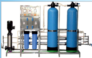
WATER TREATMENT PLANTS