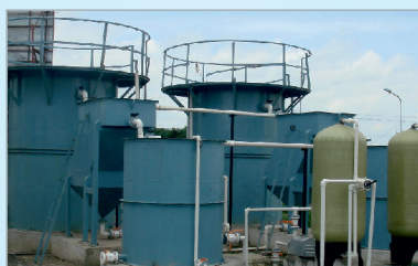
EFFLUENT TREATMENT PLANTS