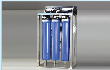
DOMESTIC WATER PURIFIERS